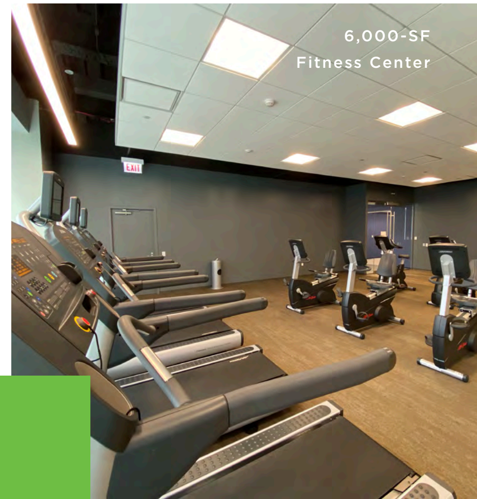
6,000-SF Fitness Center