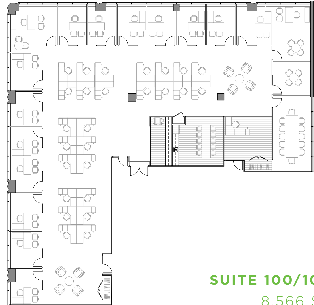
SUITE 100/104 8,566 SF